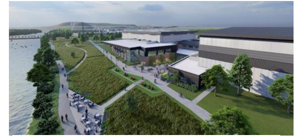
Eau Claire Community Complex, Eau Claire New Money, $38,600,000

October 2022: Bond financing facilitated by WHEFA helps Benevolent finance the repositioning of the main healthcare building on its Cedar Lake Campus by consolidating the skilled nursing households and rehabilitation beds, creating new therapy space, adding 15 independent living loft-style apartments, and 16 additional independent living plus apartments. The project also includes additional dining, social, and wellbeing spaces, as well as additional administration areas, garages for residents and exterior improvements.