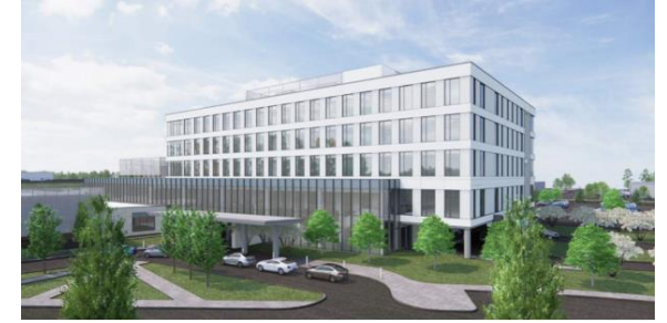
Bellin Health, Ashwaubenon & Green Bay, New Money, $130,000,000

October 2022: Bond financing facilitated by WHEFA helps build the John and Carolyn Sonnentag Event Center and Fieldhouse in Eau Claire, which will benefit UW-Eau Claire and surrounding community. This facility will include a 5,000-capacity event center, a 100-yard turfed indoor sport field and the Mayo Clinic Health System Diagnostic Imaging and Sports Medicine Center.