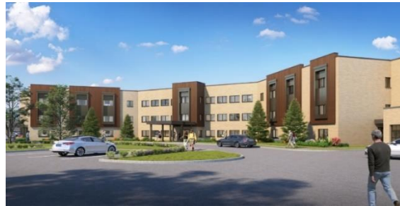
Benevolent Cedar Community, West Bend, New Money, $41,000,000

September 2022: Bond financing facilitated by WHEFA helps Carthage College construct a new campus maintenance building to make room for a new engineering department in vacated maintenance space within an existing academic building, as well as complete renovations to its softball field and certain HVAC units on the campus.