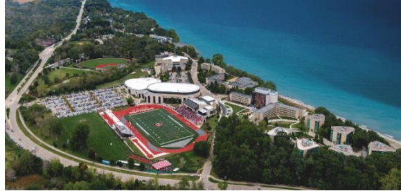
Carthage College, Kenosha, New Money, $8,000,000

A representative sample of WHEFA's recent financings include: